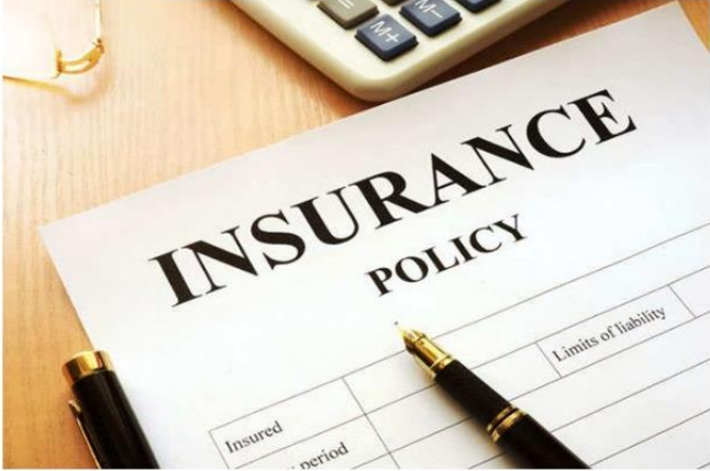
insurance, health insurance, health insurance products, health risks, IRDAI, exclusions, health insurance policies, free health check up, home treatment,